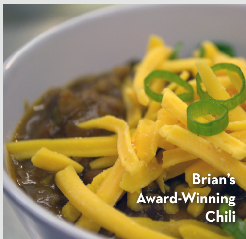
Brian's Award-Winning Chili

Add grilled or fried chicken $4.25 | Add steak $6 | Add shrimp $5.50 | Add salmon $8