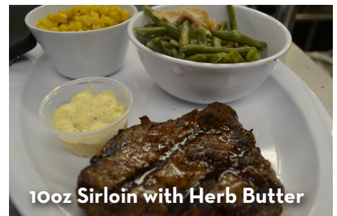
10oz Sirloin with Herb Butter

** Consuming raw or under-cooked meat, poultry, eggs, or seafood, may increase your risk of food-borne illness