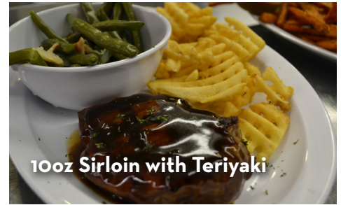
10oz Sirloin with Teriyaki

Veggie Plate with two sides $11. 75 / with four sides $17. 50 House/Caesar salad or cup of soup