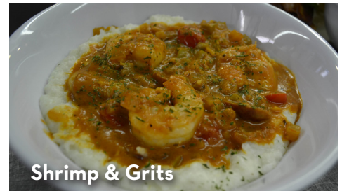
Shrimp & Grits